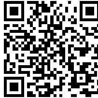
Request for Hearing