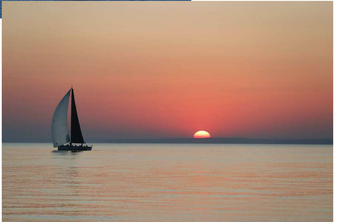
PRIZE GIVING AND CLOSING CEREMONY AT DMARIN GOCEK EVENT AREA